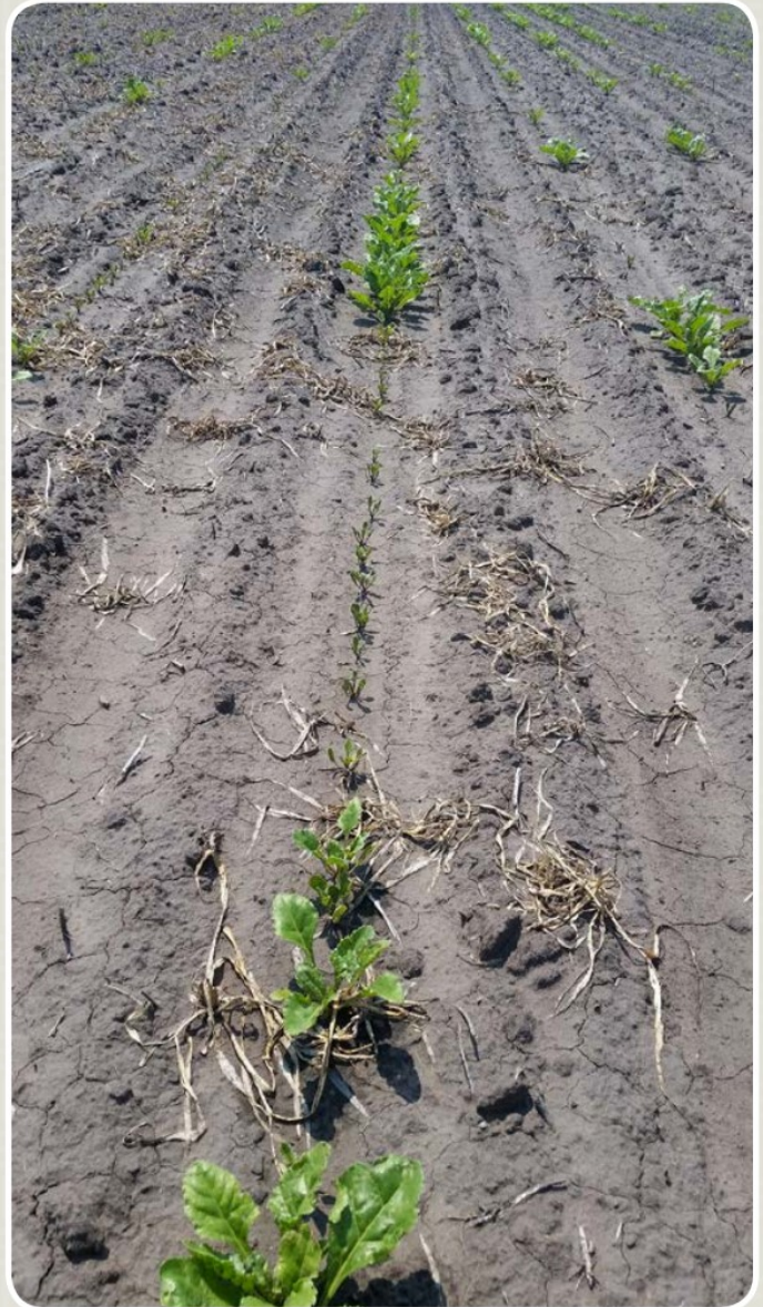
Pendimethalin (Prowl H2O) soil residue caused stunting damage in sugar beet

The best advice for growers in low rainfall situations following residual herbicide application is to assess their risk based on rainfall from June 1st to September 1st. Consult with your Agriculturist and/or herbicide company representatives to determine the best rotational cropping options, which may be to plant a more tolerant crop the following year to minimize the risk of crop injury.